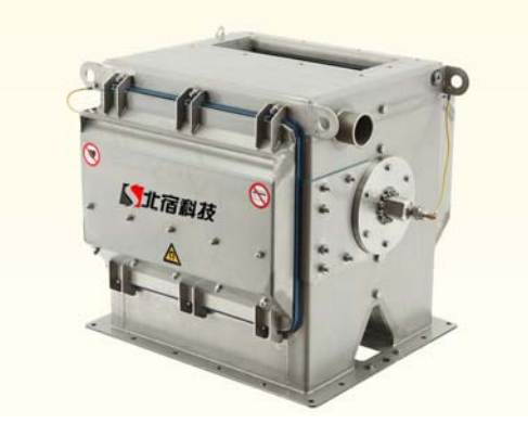
Drum In Housing Separators

The Permanent / Electro Magnetic Drum is always used in resource recovery, mineral treatment, recycling materials and other industries in conditions which need to obtain high purity material. The drum magnets are mainly used to effectively sort large pieces of magnets or fine ferromagnetic particles, and realizing automatically iron removal.