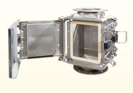
Plate House Magnet

The stainless steel housing, two plate magnets mounted on both sides and the center drawer constitute the plate house magnet. A typical deep reach magnet separator utilizes two large magnets on each side of a chute to grab large tramp metal as it passes though the stainless steel housing. The plate house magnet is designed for products that are easy to bond or bridge.